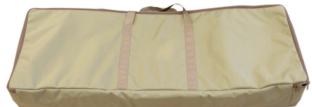
Soft transport case