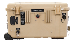
24VDC Li BOS 2400-120 Item # 20-0205201