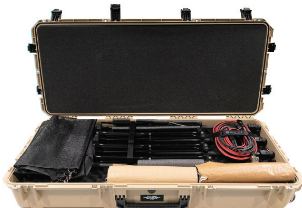
Hard transport case with open lid

*Based on five hours of solar irradiance