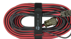
24VDC Solar Bayonet Extension Cable 25 ft, 6AWG - Item # 13-0000057 50 ft, 6AWG - Item # 13-0000066 75 ft, 6AWG - Item # 13-0000067