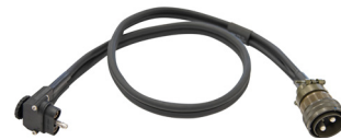
24VDC 2-Pin Inter-Connect Cable Item # 13-1000294