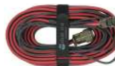
24VDC Solar Bayonet Extension Cable 25 ft, 6AWG - Item # 13-0000057 50 ft, 6AWG - Item # 13-0000066 75 ft, 6AWG - Item # 13-0000067