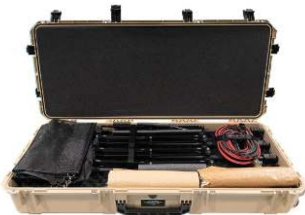
Hard transport case with open lid