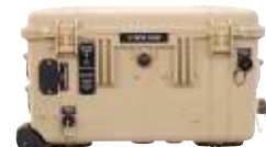
24VDC Li BOS 2400-120 Item # 20-0205201