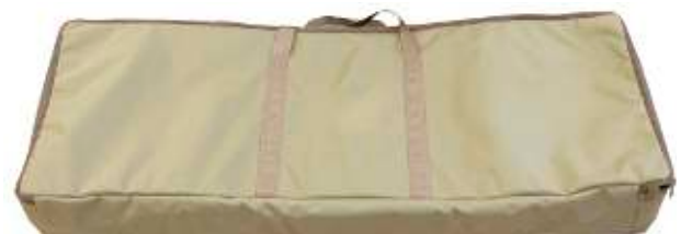
Soft transport case

*Based on five hours of solar irradiance