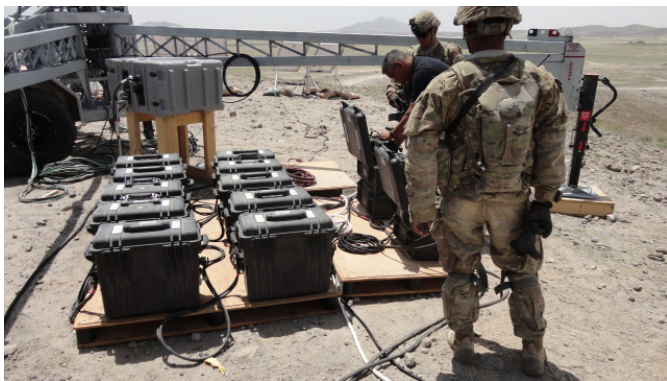
Figure 5 - Training taking place at the OP site

The Solar Stik 3.0 kW Hybrid Power System is composed of rugged components that are proven to operate in extremely harsh environmental conditions and use simple principles for operation—scalability, adaptability, and autonomy. The modularity of the Solar Stik System allows for easy scaling up or down based on the load requirement, and the operator can choose the exact capabilities to meet their mission requirements. Open architecture allows for the integration of additional components often used in the field that are not native to the Solar Stik System. Batteries provide power on demand to the load, and only the exact amount of power that is required to support the load is used. The Solar Stik Hybrid Power System consists of power generation, power storage, and power management components that work in concert to ensure high overall operating efficiency and that the most operationally effective energy source is used first.