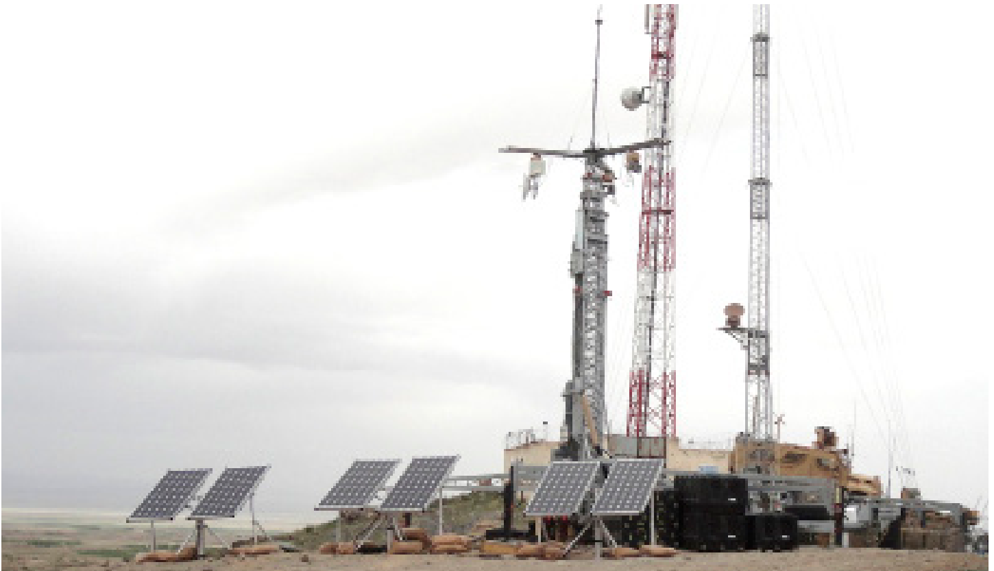
Figure 1 - The Solar Stik 3.0 kW TQG Hybrid Power System powering ISR assets