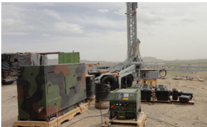
Figure 6 - The 3.0 kW TQG Hybrid Power System replacing the 60 kW Generator