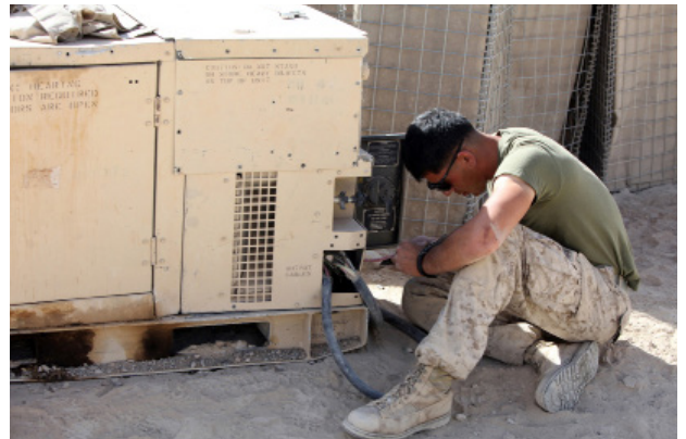
Figure 3 - Marine working on broken generator