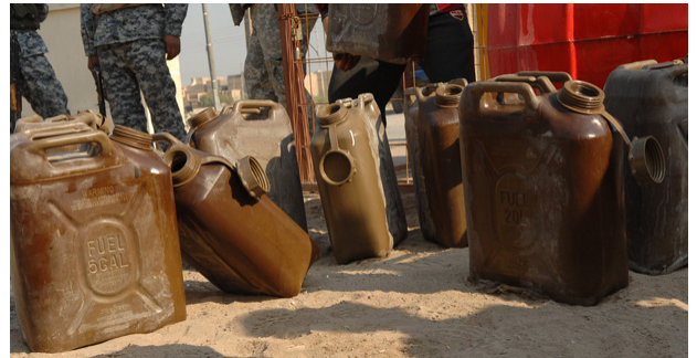
Figure 2 - Fuel tanks for a portable generator

The two ISR assets required the 60 kW TQG to operate at only 2.5% of its rated capacity, severely underloading the engine. This inefficient use of fuel can shorten the service life of a TQG, and power surges from a poorly running generator can damage the sensitive electronic equipment at the OP. Daily refueling and an accelerated maintenance schedule also posed additional risks by preventing Soldiers from performing their primary missions of training the Afghan Army and conducting Village Stability Operations (VSO).