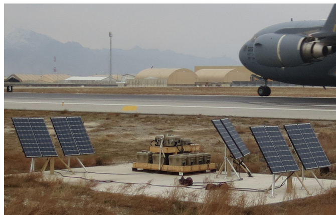
Solar Stik 400 with optional Outrigger Kit