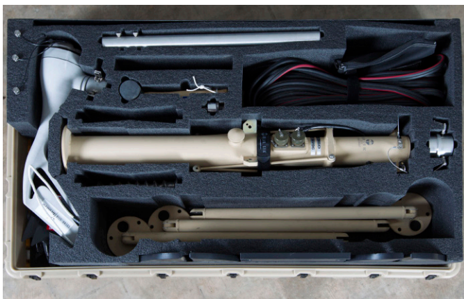
Solar Stik 400 transport case showing optional Breeze Mast Upgrade