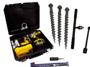
Hard Earth Bore Kit