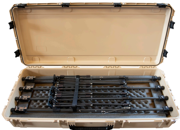
Hard transport case with open lid

*Based on five hours of solar irradiance