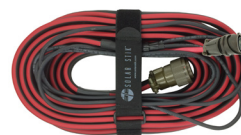
24VDC Solar Bayonet Extension Cable